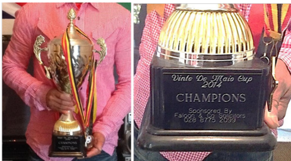
Figure 3. The cup and medals won by Fitun Unidade during the May 20 th tournament in 2014

The photograph on the left shows the cup and it shows the ribbons, which are draped around the cup and which are tied to the medals. The ribbons are in three of the colours of the national flag of Timor-Leste: Red, yellow and black. The photograph on the right shows the date of the tournament engraved on the base of the cup, in Portuguese and in English.