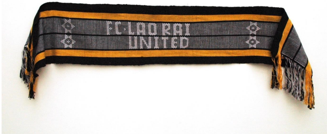
Figure 2. A black, white and yellow tait with the name of FC Lao Rai United.