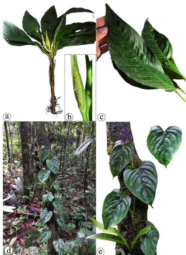
Figure 2. a-c. Dieffenbachia elegans . a. entire plant and habit. b. Detail of flowers on spadix. c. Detail of leaf blade, midrib and venation. d-e. Philodendron toshibai . d. Habit. e. Detail of Leaf blade.

Diagnosis: Terrestrial herb with unisexual flowers. Stem erect, brown. Leaves forming an apical crown, petiole green, without markings, sulcate adaxially, obtuse abaxially; leaf blade asymmetrical, green or sometimes variegated with white, midrib grooved adaxially, prominent abaxially, primary lateral veins impressed on both sides, venation reticulate. Inflorescences erect, several, green peduncle, cylindrical, spathe strongly constricted, light green; female flowers white, male sterile flowers translucent, fertile male flowers white.