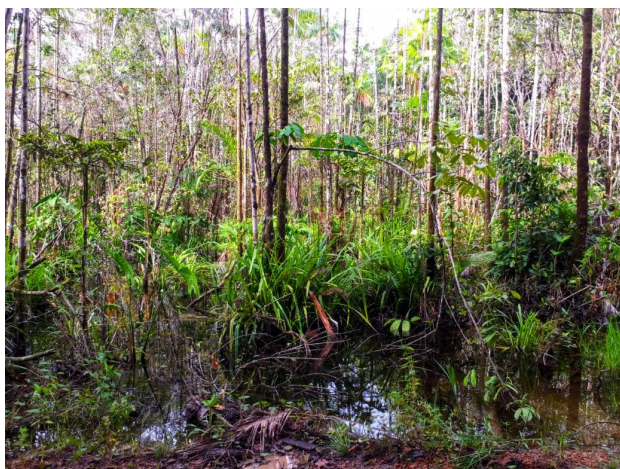
Figure 1. Collection area of Várzea Forest, Floresta Estadual do Amapá, Amapá State, Brazil.

The diagnosis follow the terms and concepts of Croat & Bunting (1979) and Ellis et al. (2009). The morphological characteristics were examined and the colors of both vegetative and reproductive structures